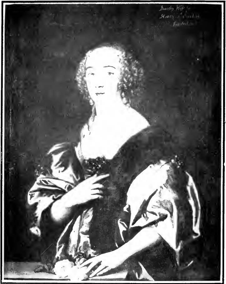
DOROTHY, COUNTESS OF SUNDERLAND.